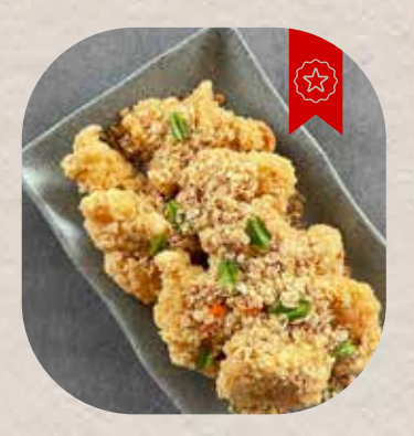
Crispy Cereal Dori 80.000 IDR