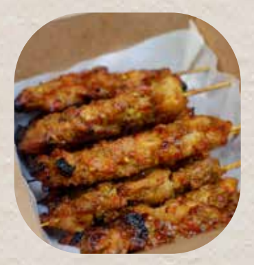
Asian Spices Satay (10pcs) 80.000 IDR