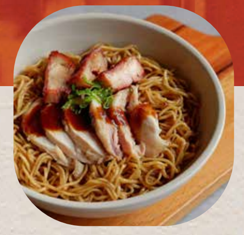
Bakmi Ayam Signature (manis) 40.000 IDR