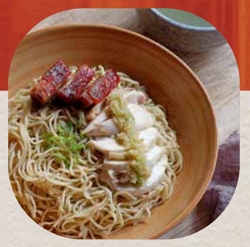
Bakmi Ayam Signature (asin) 38.000 IDR