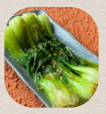
Stir-fry Garlic Pokchoy 40.000 IDR