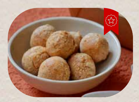
Bakso Goreng (8pcs)