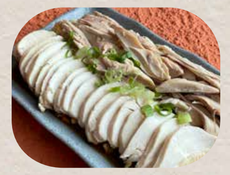
Poached Chicken 85.000 IDR