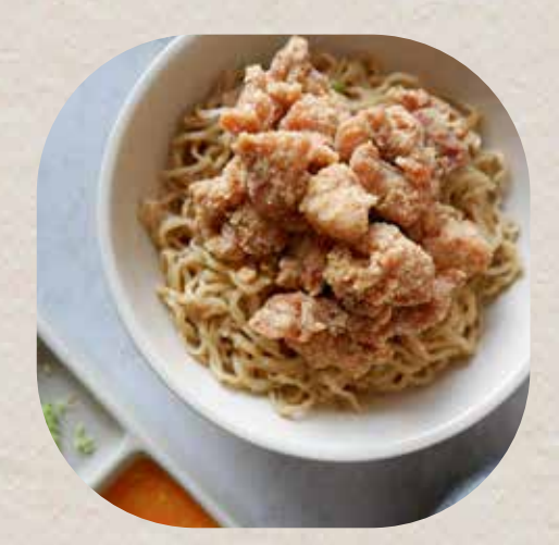
Bakmi Ayam Crispy Original 34.000 IDR