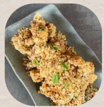
Crispy Cereal Chicken 80.000 IDR