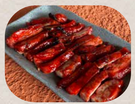
Char Siew Chicken 100.000 IDR

Eating together makes a healthier family. These are perfect meals that everyone loves and make them leaving the dinner table happy and pleased.