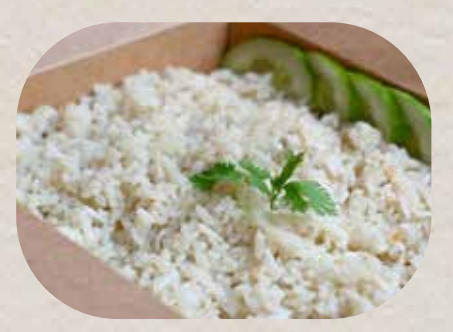
Hainam Fragrant Rice 55.000 IDR