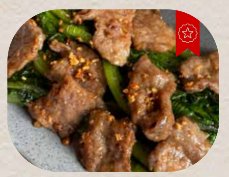
Beef HK Style 100.000 IDR