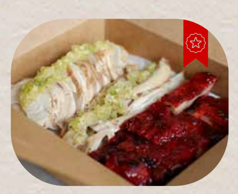
Poached Chicken & Char Siew Chicken 110.000 IDR