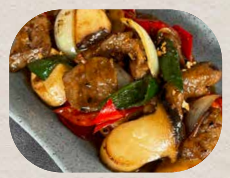
Mongolian Beef 120.000 IDR