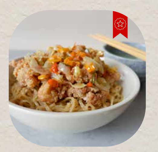
Bakmi Ayam Crispy Matah 36.000 IDR