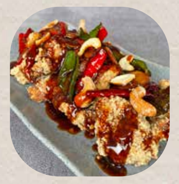
Kung Pao Chicken 80.000 IDR